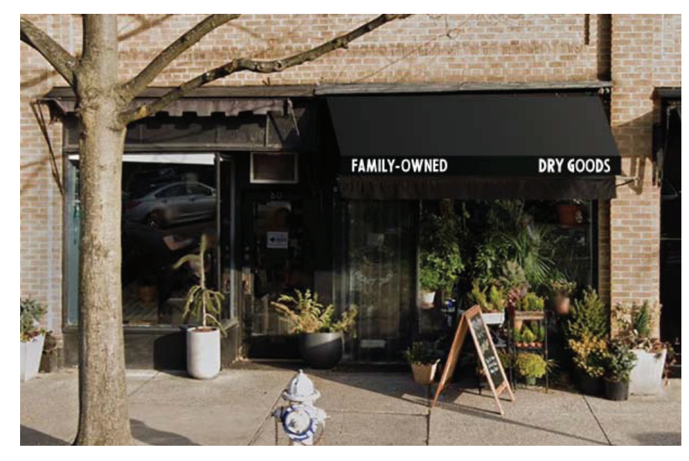
INSTALLATION RENDERING NOT TO SCALE

San Signs & Awnings 925 Saw Mill River Rd. Yonkers, NY 10710