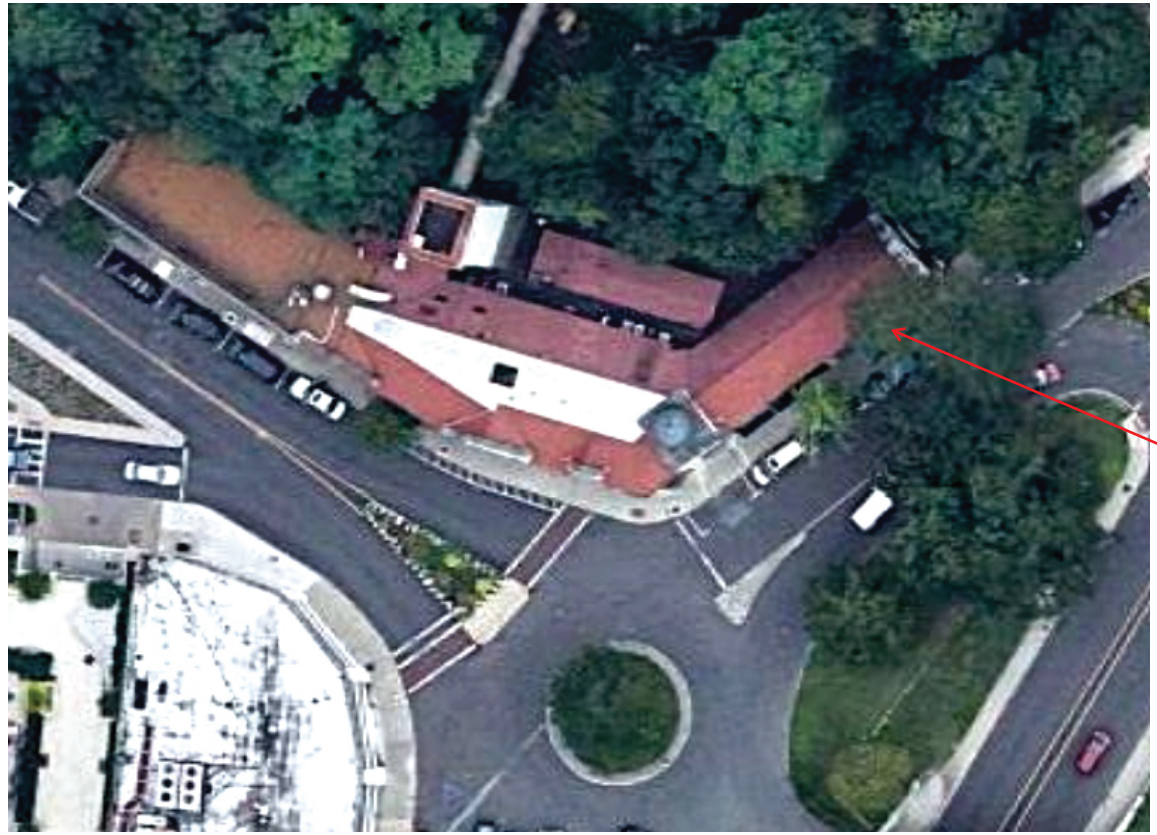
AWNINGS AND GLASS GRAPHICS

The layout / design are herein reserved to Manhattan Signs and may not be used without its written permission. The original artwork is protected under Federal Copyright Laws. Make no reproductions.