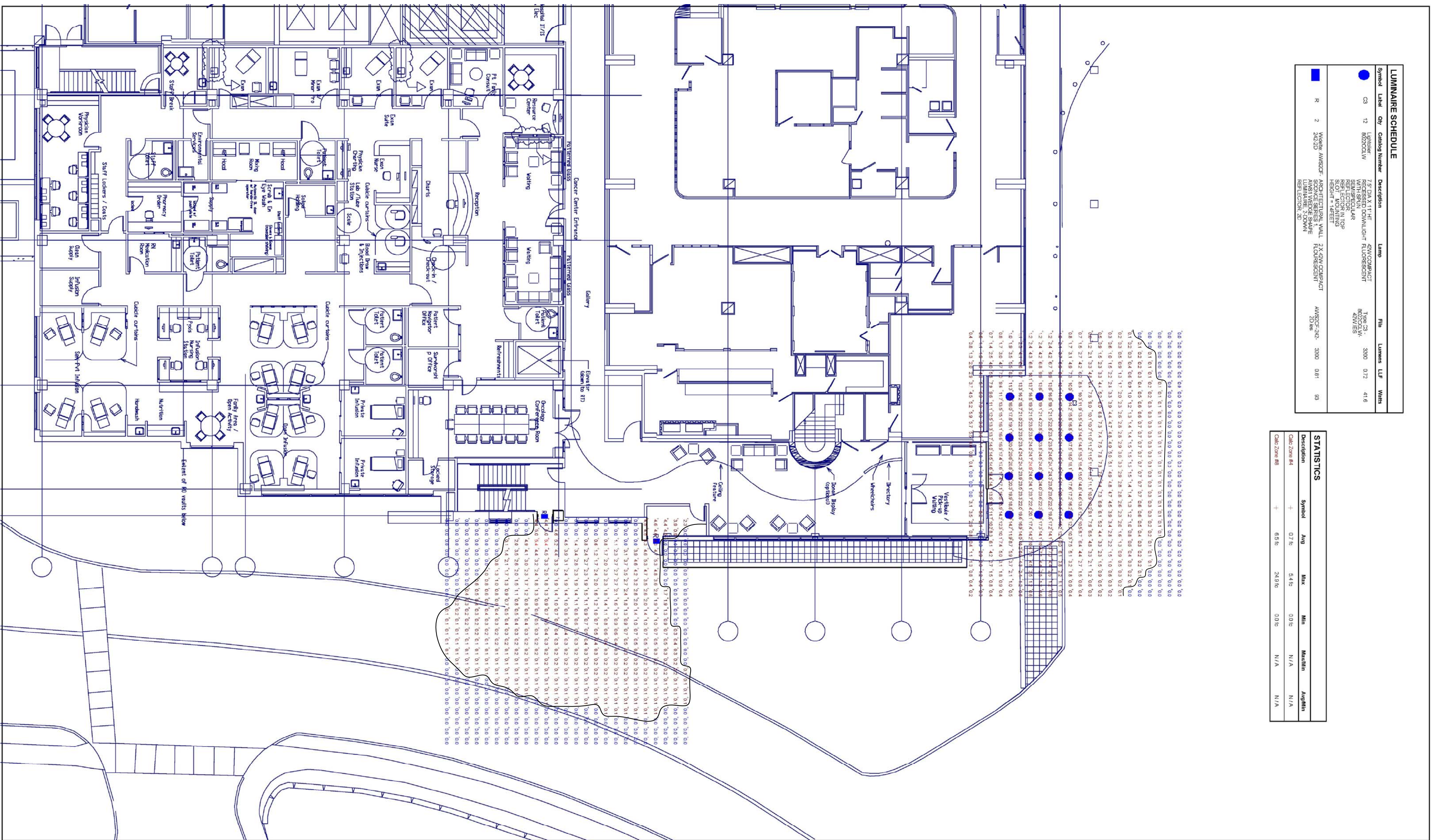
01 PHOTOMETRIC STUDY @ FIRST FLOOR SCALE: N.T.S.